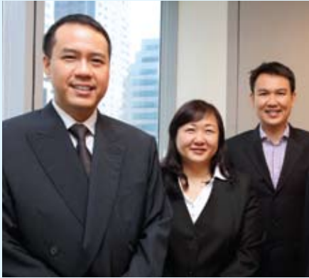
TPC Asset & Wealth Management Directors

acts for many foreign financial institutions including DZ BANK, Nordea Bank, Bank Mandiri, China Construction Bank, Chinatrust Commercial Bank, Qatar National Bank, Arab Bank and Emirates Bank. It is grouped into 5 departments: corporate, banking and finance, real estate and conveyancing, asset and wealth management, litigation and dispute resolution and intellectual property.