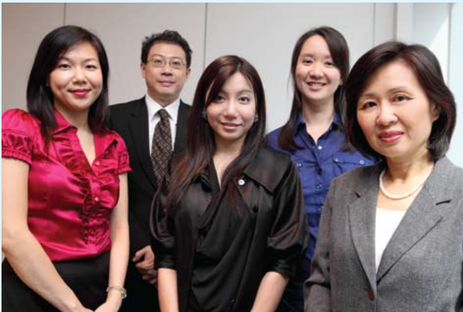
TPC Real Estate & Conveyancing Lawyers

TAN PENG CHIN LLC Advocates and Solicitors Notary Public Commissioner of Oaths 30 Raffles Place #11-00 Chevron House Singapore 048622 Tel: (65) 6532 1808 Fax: (65) 6534 5433 www.tpclaw.com.sg